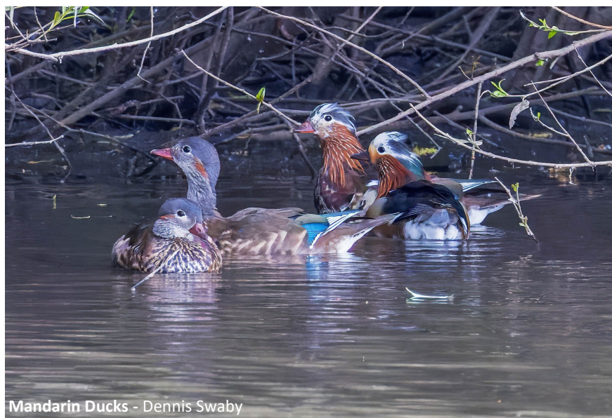
Mandarin Ducks