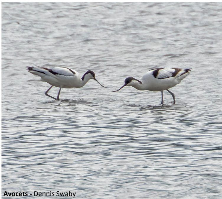
Avocets