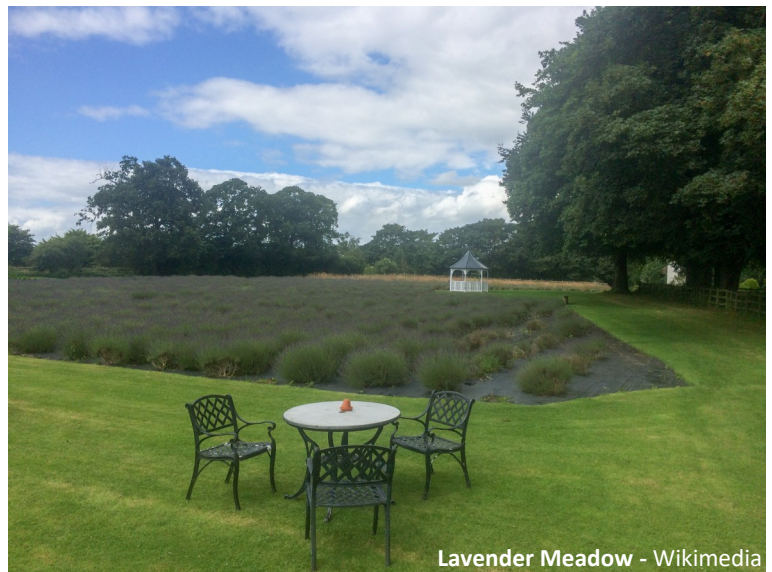
Lavender Meadow

Swettenham Valley is a hidden gem. It comprises a mosaic of habitats including ancient woodland, wildlife rich ponds, scrub and meadows intersected by numerous wet springs and flushes.