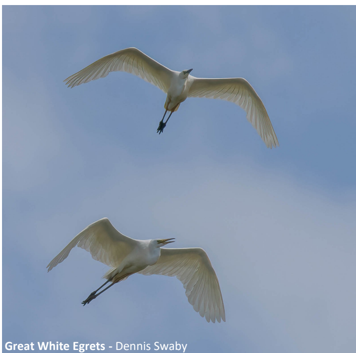
Great White Egrets - Dennis Swaby