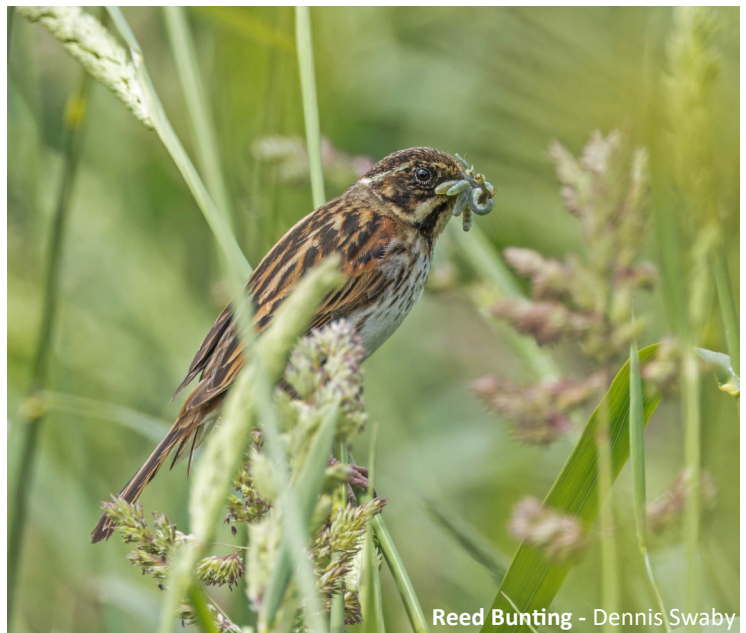
Reed Bunting - Dennis Swaby

This is a small selection of species seen in the SECOS Recording Area.