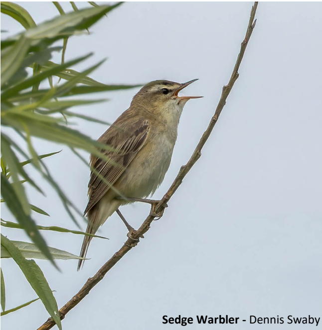
Sedge Warbler - Dennis Swaby

EHF/PHF/MGT/RF: Pheasant, Red-legged Partridge , Swift, Kingfisher, Skylark, Sand Martin, Swallow, House Martin, Cetti's Warbler , Chiffchaff, Reed Warbler, Sedge Warbler, Blackcap, Lesser Whitethroat, Whitethroat, Treecreeper, Stonechat, Pied Wagtail, Grey Wagtail, Bullfinch, Greenfinch, Linnet, Reed Bunting