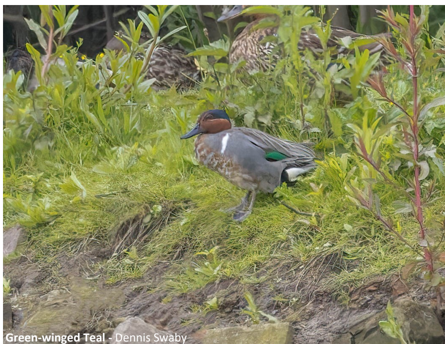
Green-winged Teal - Dennis Swaby