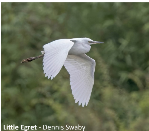
Little Egret - Dennis Swaby