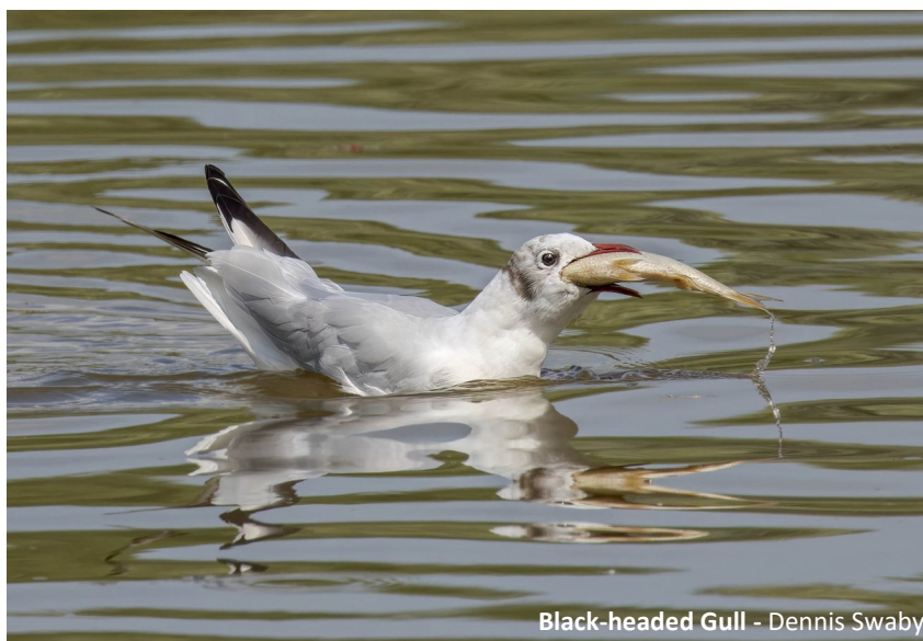
Black-headed Gull - Dennis Swaby