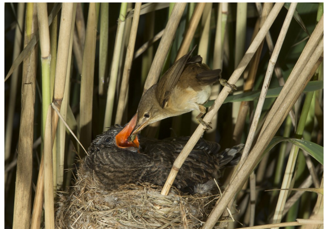
Reed Warbler feeding Cuckoo chick